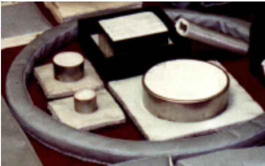
Box edge style side main donut gasket shown with peep hole plug covers and exhaust port covers laying on the inner diameter.

Mid-Mountain Materials, Inc. manufactures a comprehensive range of sealing and insulating components used in both open top and closed top style carbon baking furnaces. THERMOPAK® Side Main Donut Gaskets are designed to achieve maximum sealing performance, improve plant health and safety by eliminating refractory ceramic fibers, resist compression and crushing, and provide maximum service life in this demanding application. Some of the features and benefits of THERMOPAK® Side Main Donut Gasket are mentioned alongside the photo below.